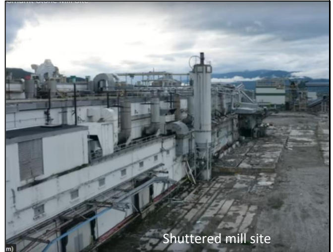
Shuttered mill site

A: A company called M2Green Redevelopment LLC owns most of the former mill site while another company called MLH Montana—a subsidiary of Washington-based Wakefield—owns several smaller parcels. Wakefield acquired some of the property after the previous owner—M2Green Redevelopment—failed to pay its bills, including property taxes. In 2015, both M2Green and the previous owners of Smurfit agreed to conduct an investigation and cleanup of the environmental contamination at the site to ensure it is safe for redevelopment. Seven years later, the investigation is still underway, meaning no significant cleanup has occurred and the bulk of the site remains unused.