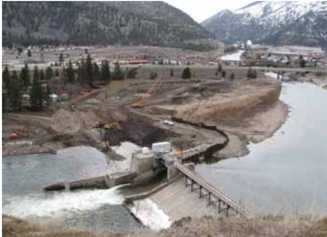
Milltown Dam and Reservoir, 2008