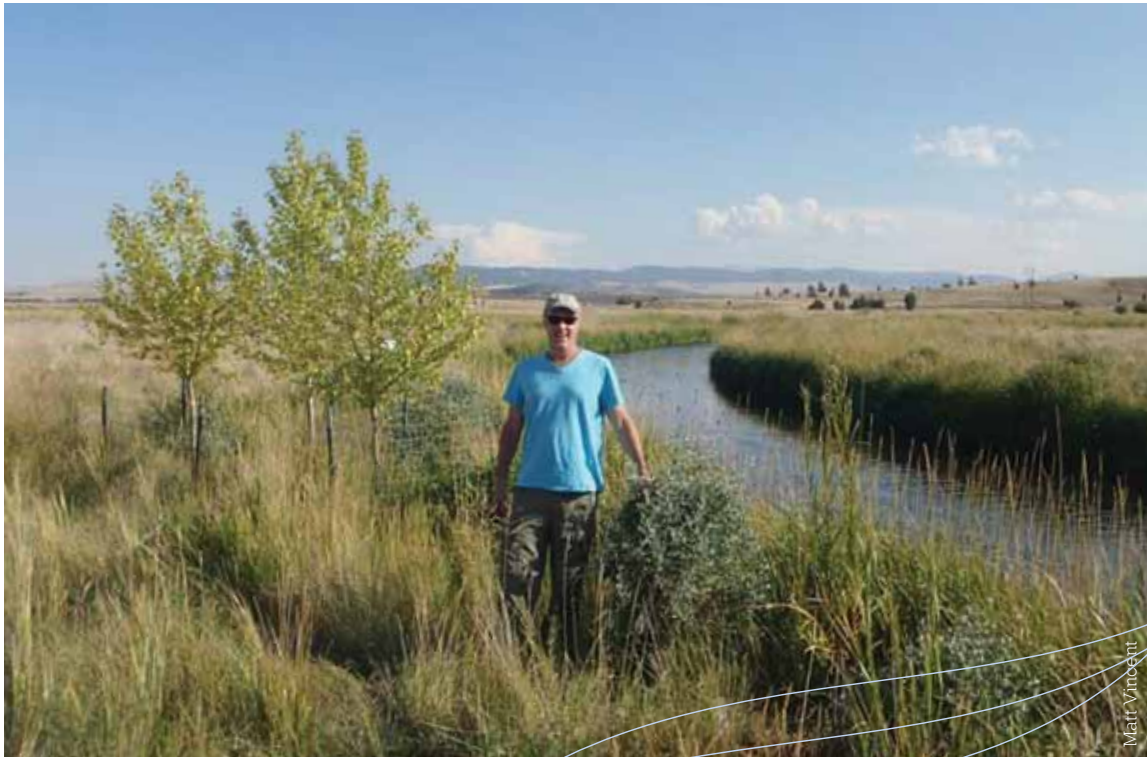
Silver Bow Creek before restoration