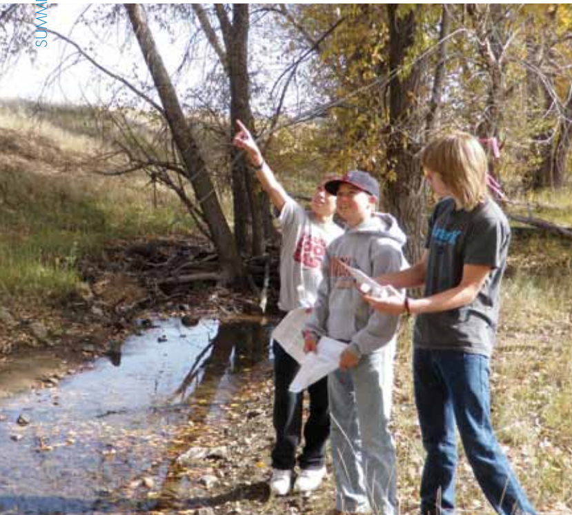
For students, stream restoration offers a real-world learning opportunity.

mining waste on 43 miles of the mainstem Clark Fork between Butte and Missoula is set to begin.