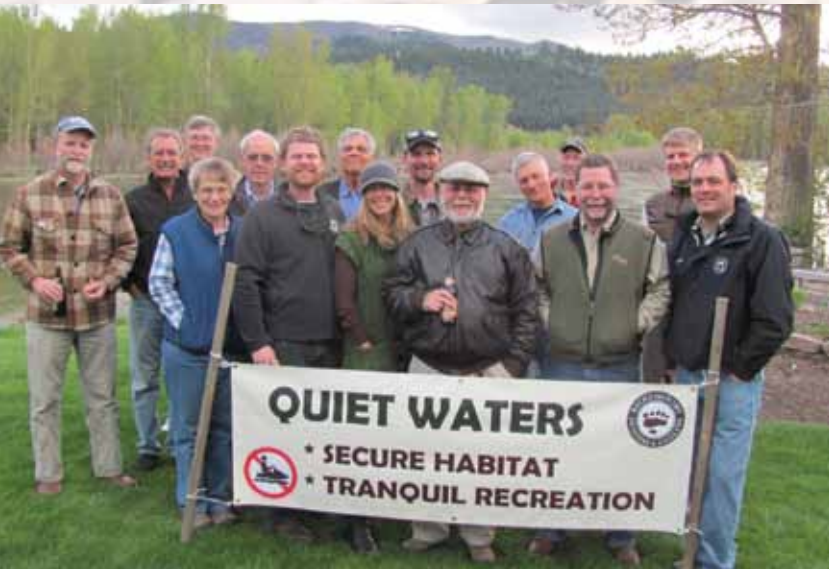
Celebrating the Quiet Waters victory with our partners.