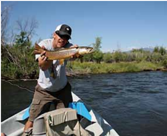
Restoration in the Upper Clark Fork means better fishing for local anglers.

Meanwhile, 120 miles downstream, the confluence of the Blackfoot and Clark Fork rivers is free-flowing after the 2008 removal of the 100-year-old Milltown dam, meaning that thousands of stream-miles are now opened up to fish, which can migrate past the former dam site and head up the Clark Fork, Blackfoot, and Rock Creek. And a cleanup of legacy