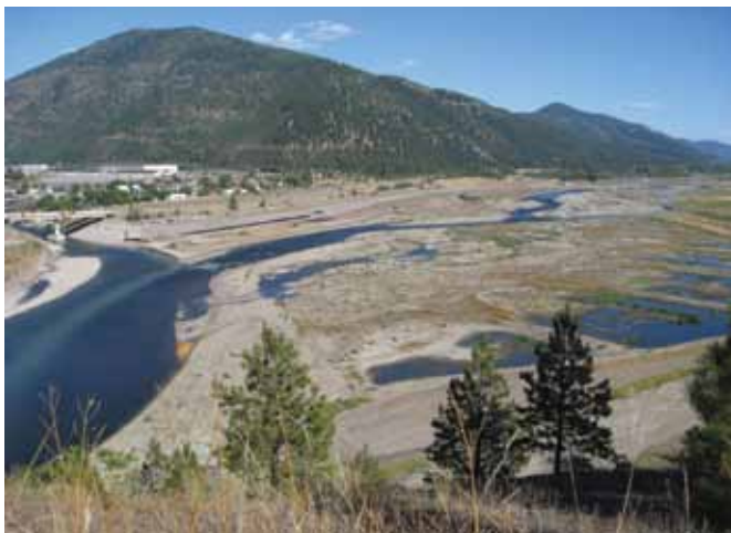
Milltown after dam removal and restoration, 2011