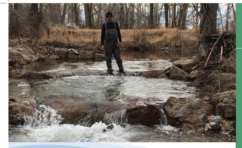
YOU helped install a new fish-friendly irrigation diversion on Racetrack Creek this year, providing trout with access to spawning grounds and refuge from predators and too-warm water in summer.

the Clark Fork and removing garbage from along its banks (all with a smile!).