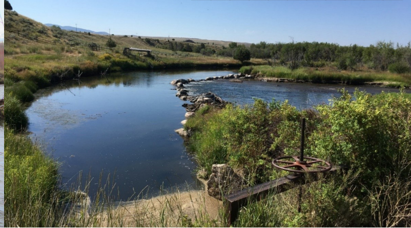
Left: The annual building and maintenance of push-up dams can have a big impact on aquatic and riparian habitat in the UCF. Right: Valiton Diversion, July 31, 2019, with river-spanning push-up dam in place.

growing West. In addition to entraining large numbers of fish, these diversions and dams fragment habitat, alter the river's natural form and function, create recreation hazards, and impair boat passage. In addition, the twice-yearly use of large machinery in the river increases erosion, degrades water quality, damages riverbeds and the aquatic invertebrates they support, and harms riparian habitat.